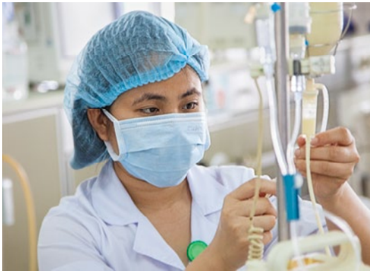
Overview of Health Care in Vietnam 8