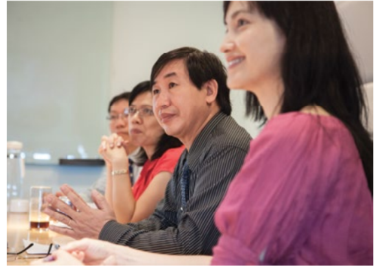
Our Business 4