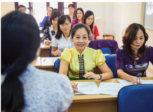
Education for Health Care Professionals 14