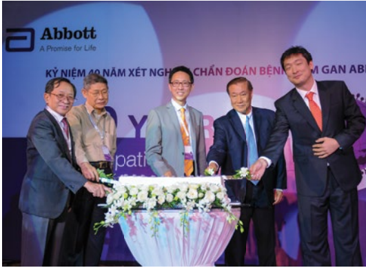
Letter from the Leaders of Abbott in Vietnam 2