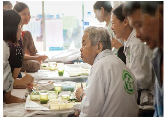
Patient Education 11