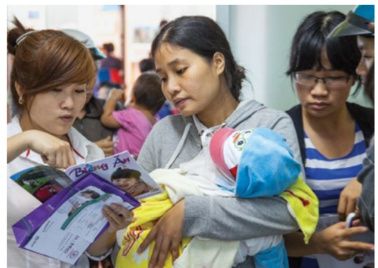
Community Outreach 18